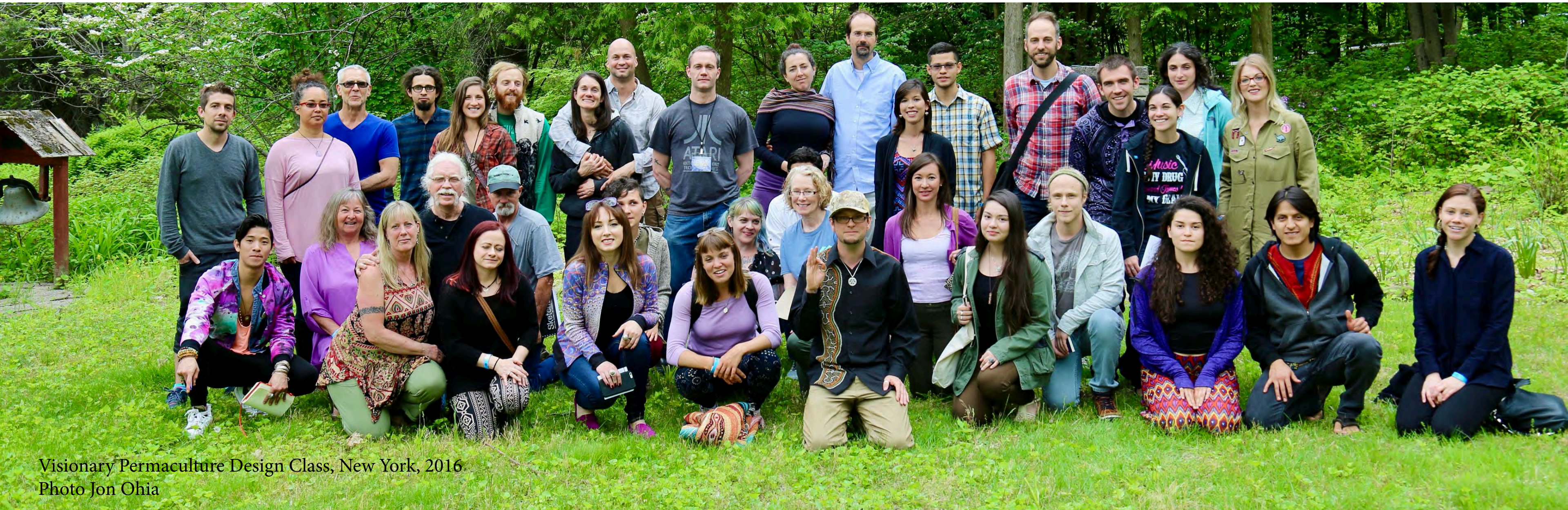
Visionary Permaculture Design Class, New York, 2016

2003-2017 Heart Gardens including Eco-Education Centre, Seed Bank + Farmers Market