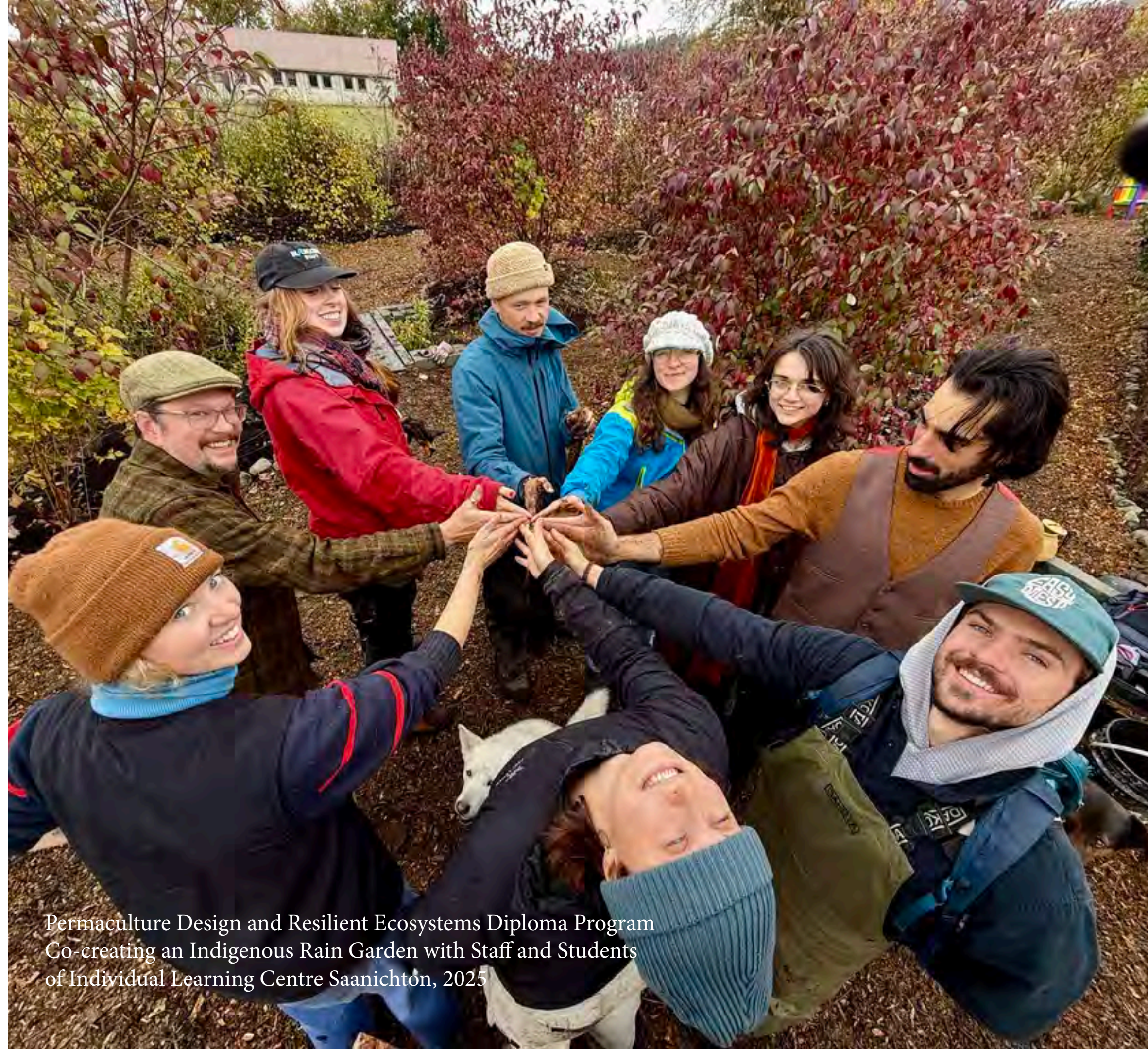
Permaculture Design and Resilient Ecosystems Diploma Program Co-creating an Indigenous Rain Garden with Staff and Students of Individual Learning Centre Saanichton, 2025