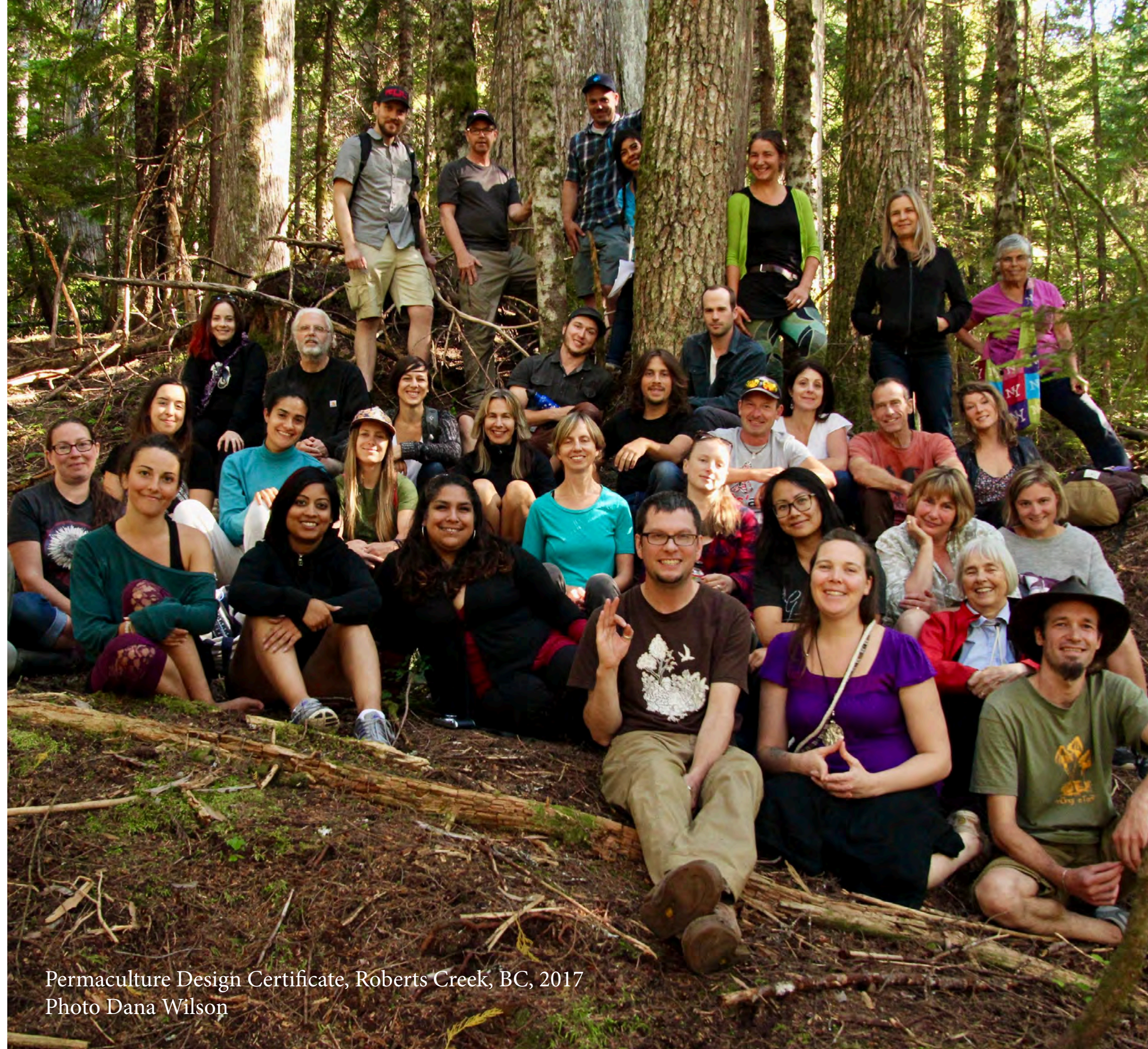
Permaculture Design Certificate, Roberts Creek, BC, 2017