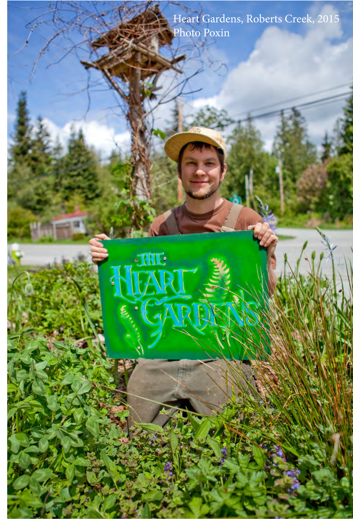
Heart Gardens, Roberts Creek, 2015