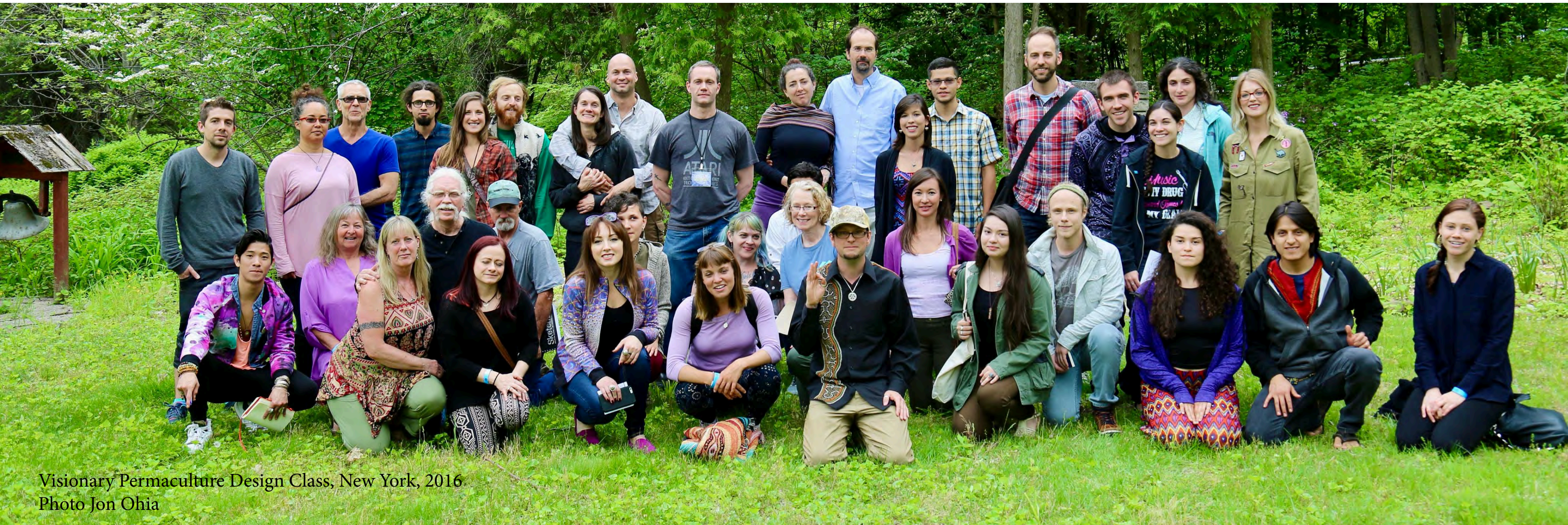
Visionary Permaculture Design Class, New York, 2016

2014-2017 Permaculture Design Teacher at Langara College